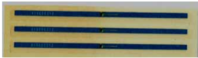
Three Hitachi Mu-chip COA wet inlets after 500 kGy gamma exposure. Note the severe degradation of the paper release liner. Inlet readability was not affected by the irradiation. Photo enlarged to show detail.

gamma dose inlets crumbled upon touch. The acrylic adhesive lost some of its holding power. It is important to note, that had these inlets been attached to an item prior to the gamma exposure, the inlets would likely have remained well affixed to the item as the adhesive was much less compromised than the paper release liner. The aluminum antenna strips and the \mu -chip IC chip appeared to be neither physically nor functionally affected.